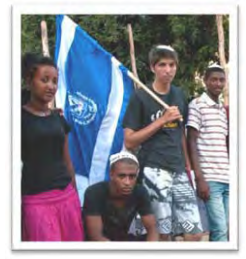
Yemin Orde Young Leadership at the rally: "We are all brethren!"

For our kids, no strangers to the feeling of being left behind, being with the protesters was a startling eye opener on many levels. Suddenly, they realized how connected they are to the spirit of the young generation outside the Village, those who carry the burden of Israel's economy and defense on their shoulders. You, our children's friends, really ought to see the events unfolding here through their eyes, and I will try my best to share their insights with you.