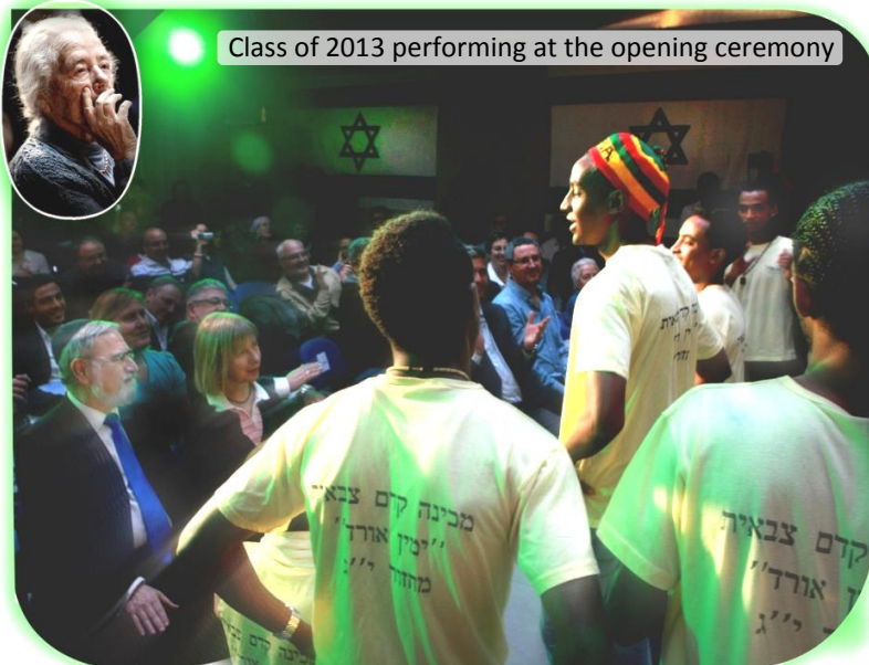
Class of 2013 performing at the opening ceremony