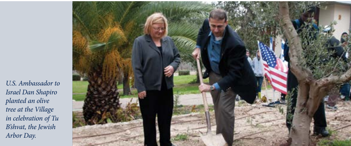
U.S. Ambassador to Israel Dan Shapiro planted an olive tree at the Village in celebration of Tu B'Shvat, the Jewish Arbor Day.