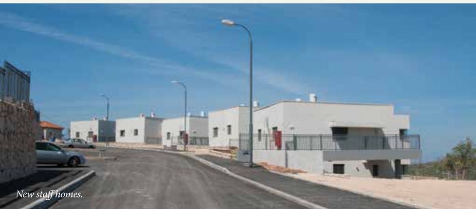
New staff homes.

The Village will continue to focus on enhancements to older buildings and other capital projects that were delayed because of the fire.