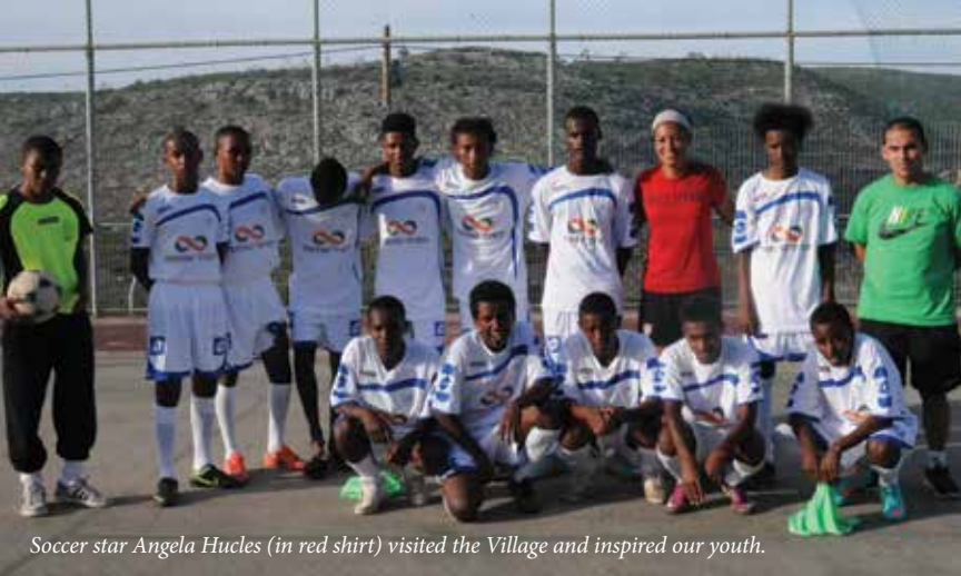
Soccer star Angela Hucles (in red shirt) visited the Village and inspired our youth.