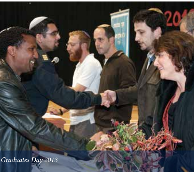
Graduates Day 2013