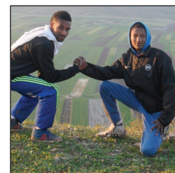
Challenge Hike builds leadership skills and self-esteem.