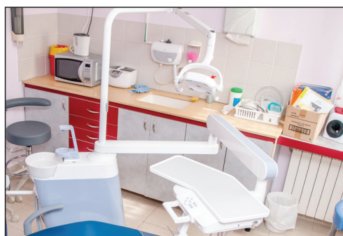
Dental health clinic at Yemin Orde.

Yemin Orde received an in-kind gift of $50,000 in new dental equipment from Henry Schein Inc. and its global supplier, Takara Belmont, to upgrade its on-site dental health clinic. The donation upgrades the equipment of the Village's dental health clinic and allows for more complex dental procedures to be conducted on site.