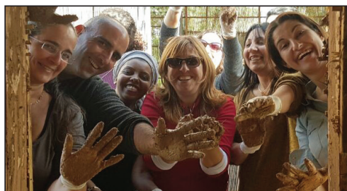
Educators from Adivi Ashkelon Ort Technology High School.

A recent Village Way workshop brought together educators from Adivi Ashkelon Ort Technology high school to learn about Ethiopian Jewish culture, agriculture, and home building practices. This workshop reflected the Village Way element of "Anchors in the Past" which helps students appreciate their own culture. The group is also considering building a Godjo (traditional Ethiopian home) at their school.