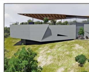
Architectural drawings of Auditorium & Cultural Center

The proposed Center would be a fitting venue for our youth to express themselves creatively through music, art and dance classes and programs. Providing a safe space that is comfortable, relaxing and conducive to creativity validates our youth's worthiness and reinforces self-esteem and confidence.